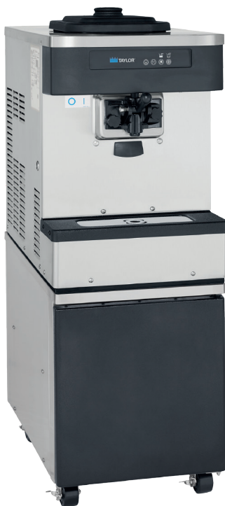
Taylor C152 with optional C208 cart