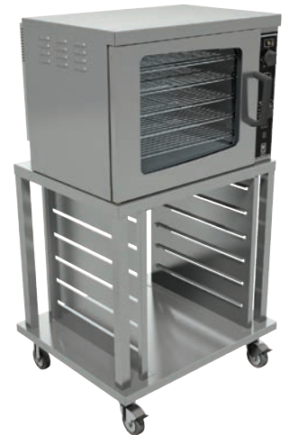
E711 on mobile stand