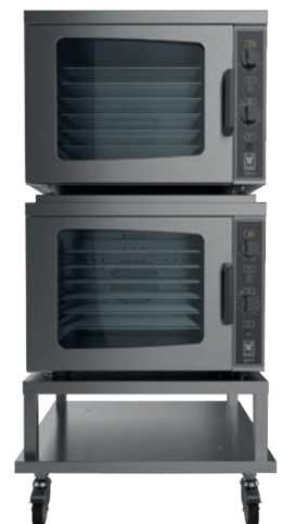
2 x E711 stacked

A clearance of 150mm should be observed between appliance and any combustible wall.